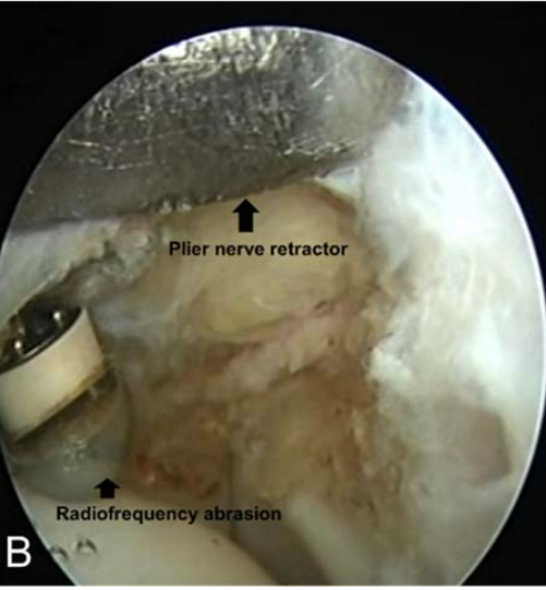
Fig. 4 Pictures from elbow arthroscopic surgery. A) synovitis elbow, B) shrinkage capsule with nerve retractor.